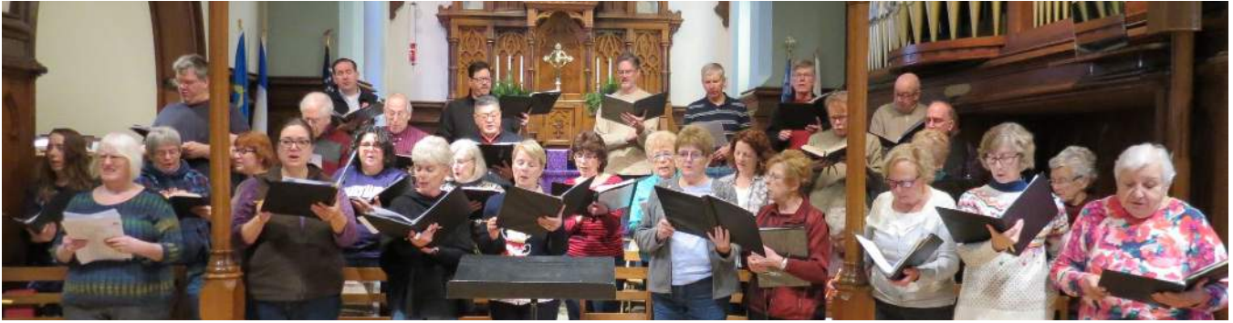
A delightful Candlelight Festival of Lessons and Carols was held on December 8 at St James' in Skaneateles, featuring a 40-voice choir from the combined choirs of St James'; St Luke's, Camillus; St. John's, Marcellus; and St. Peter and John, Auburn.