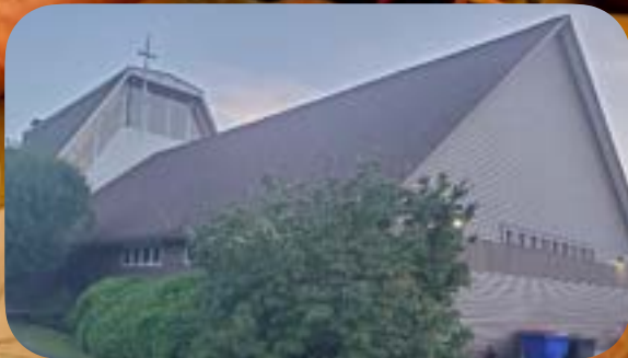
New Roof! See inside