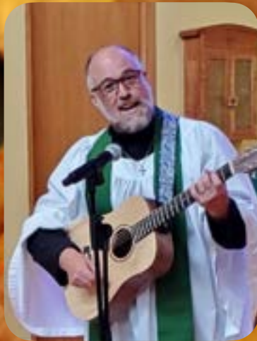
The singing pastor!

Volume 16 Issue 8 September 2021 St Luke's Episcopal Church Camillus, New York