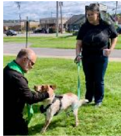
Blessing of the Animals @ St. Lukes and St. Marks