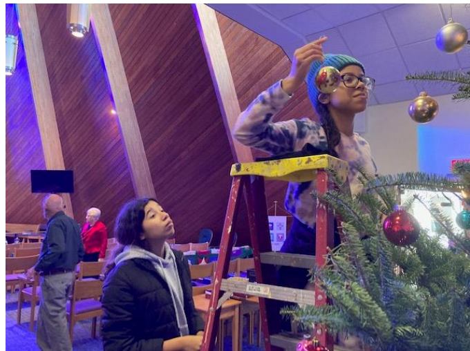
Hanging the ornaments