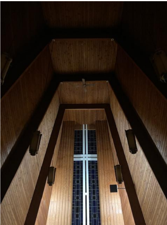
The Sanctuary at night during the Good Friday vigil