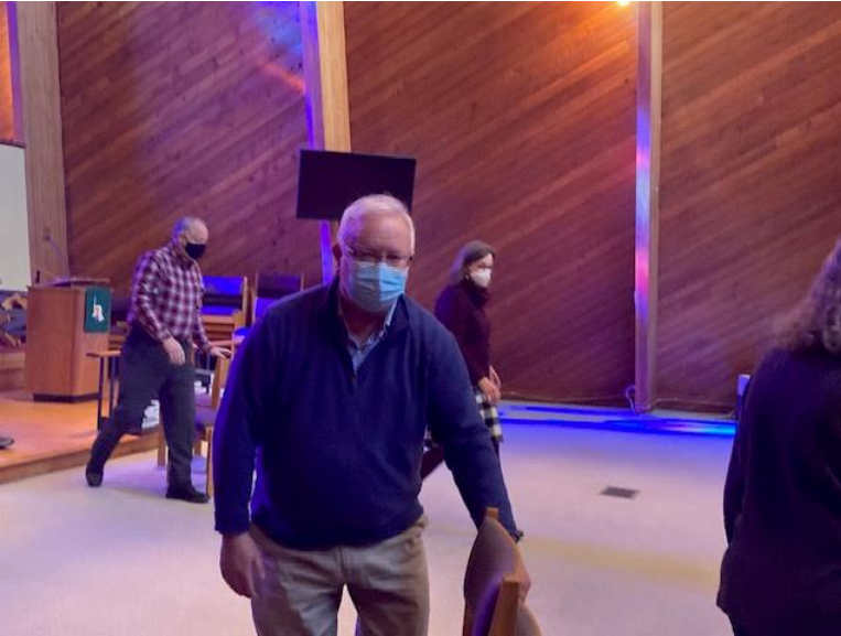
Clearing the sanctuary for installation of the new flooring