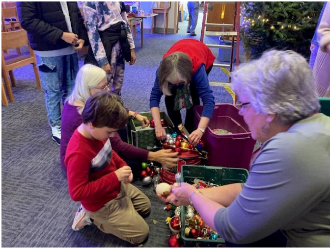
Sorting and putting hooks on Christmas ornaments