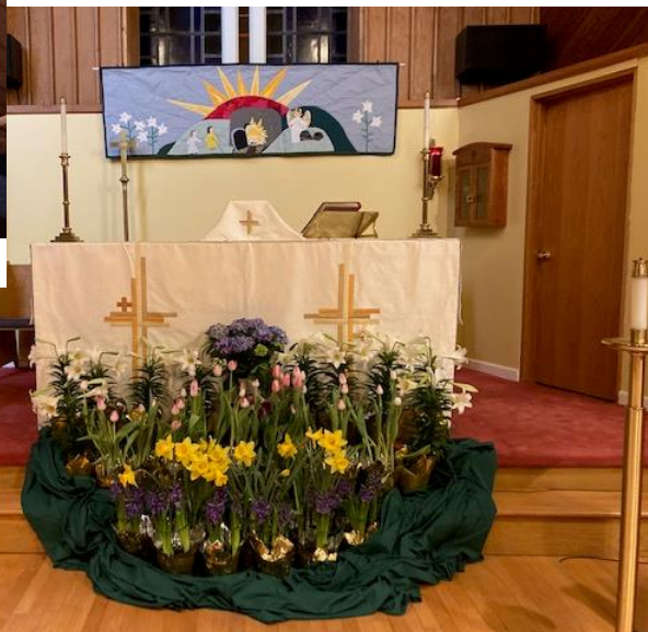
The Altar ready for Easter