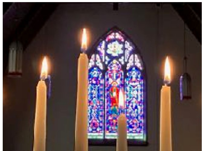
Tenebrae at St Mark's