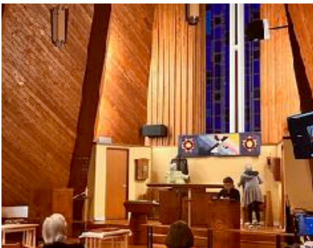
Maundy Thursday at St Luke's

For Holy Week, we again alternated the evening services between the two parishes, Tenebrae and Good Friday at St Mark's and Maundy Thursday and The Vigil at St Luke's. These are very moving and impactful services as we walk with Jesus to the cross and death. If you didn't have the opportunity to participate in all of these, I encourage you to do so next year.