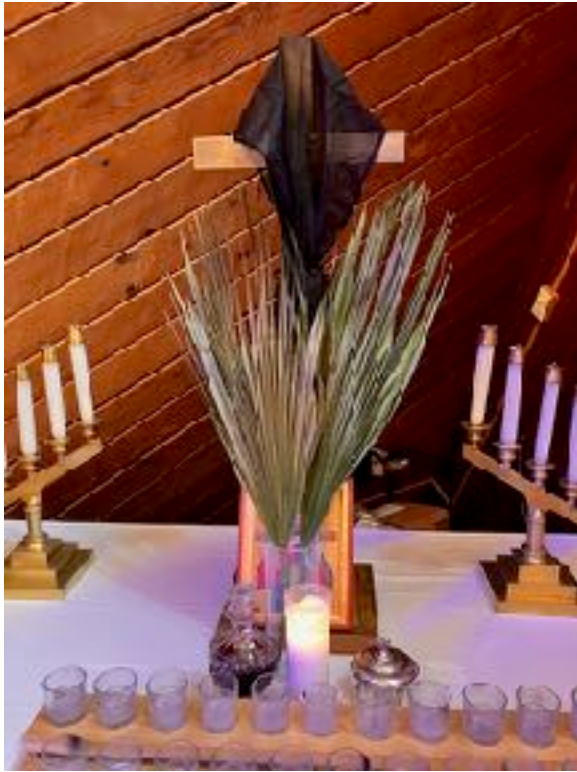
Altar of Repose after stripping the altar at St Luke's